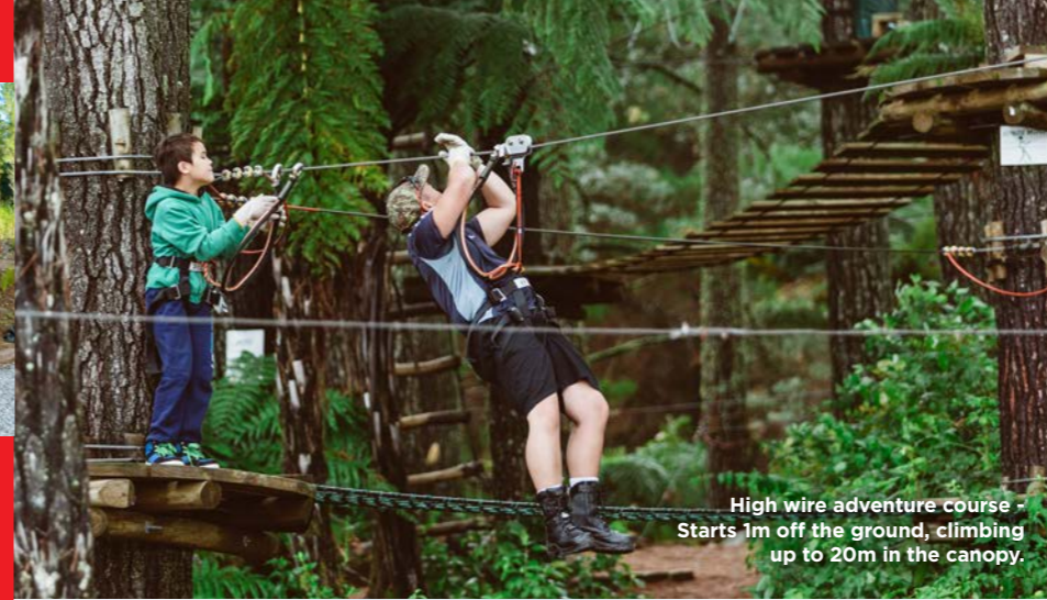
High wire adventure course - Starts 1m off the ground, climbing up to 20m in the canopy.

The Park is still growing, there are some exciting developments coming up and we want you all to be part of that - Come n' Play.