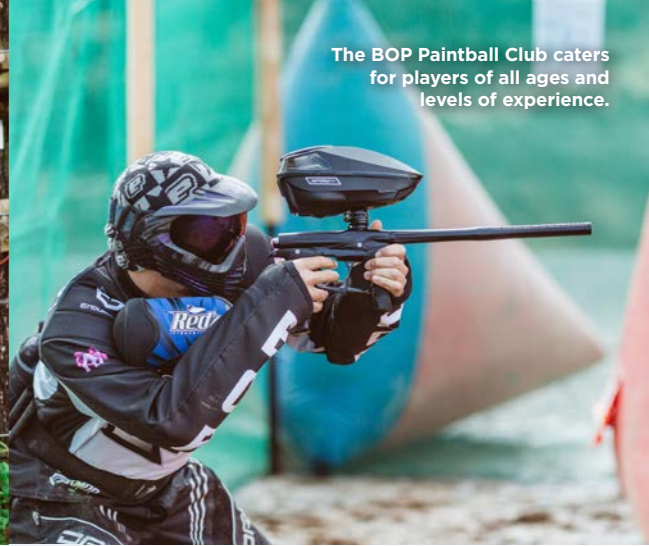
The BOP Paintball Club caters for players of all ages and levels of experience.