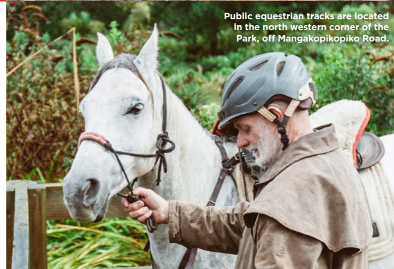
Public equestrian tracks are located in the north western corner of the Park, off Mangakopikopiko Road.

We're always looking for "good stuff" to put on the website so if you have photos or video of your visit to TECT All Terrain Park, send it in and we'll post it for everyone to enjoy.