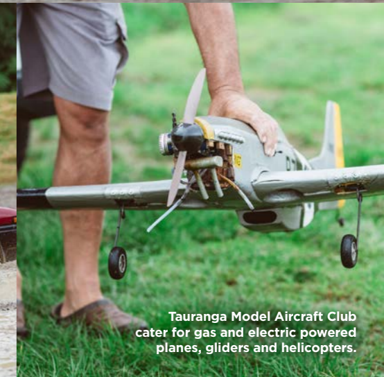
Tauranga Model Aircraft Club cater for gas and electric powered planes, gliders and helicopters.